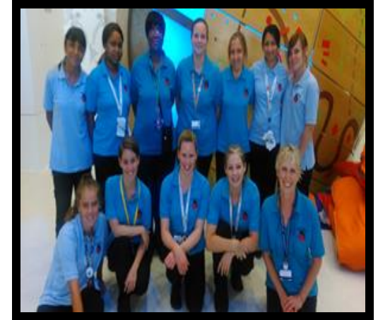
The Play Team

Welcome to The Royal London Hospital. This welcome booklet is designed for patients and their parents/carers with children/young people in hospital. This booklet contains information about the Play Team, support we offer, fun activities and events, as well as, areas to visit during your stay.